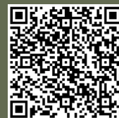
FOR PROJECT LOCATION