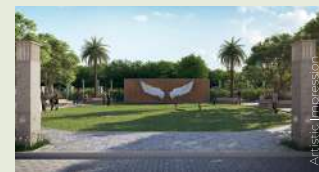
Ladies & Elderly Park with dedicated sitting, landscape & open play area.