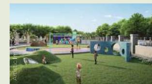
Kids Park with swings, sand pit and soft flooring.