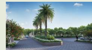
Entrance park with a highlight sculpture.