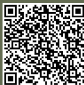
FOR DIGITAL BROCHURE