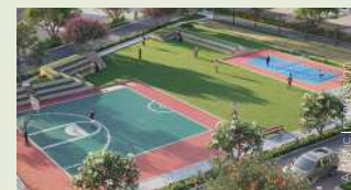
Sports facilities like Badminton Court, Basketball Court, Cricket Pitch & Amphitheatre etc.